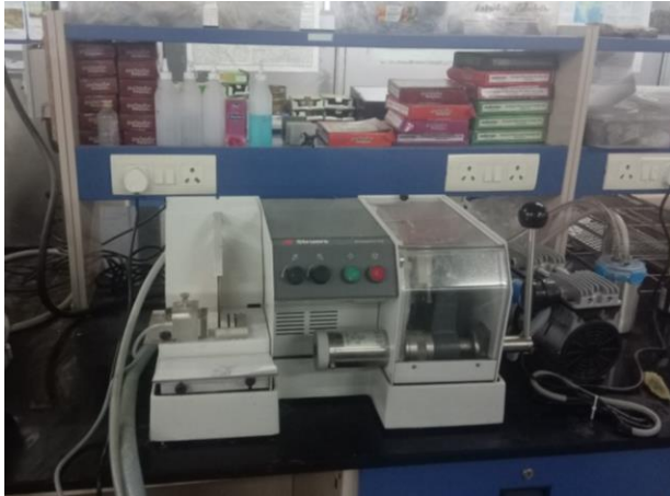
Struers Discopan-TS For cutting and Grinding