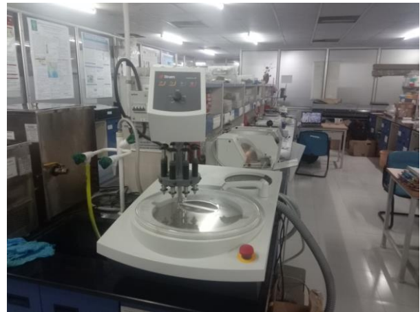
Struers LaboPol-30 & Laboforce MI For Polishing