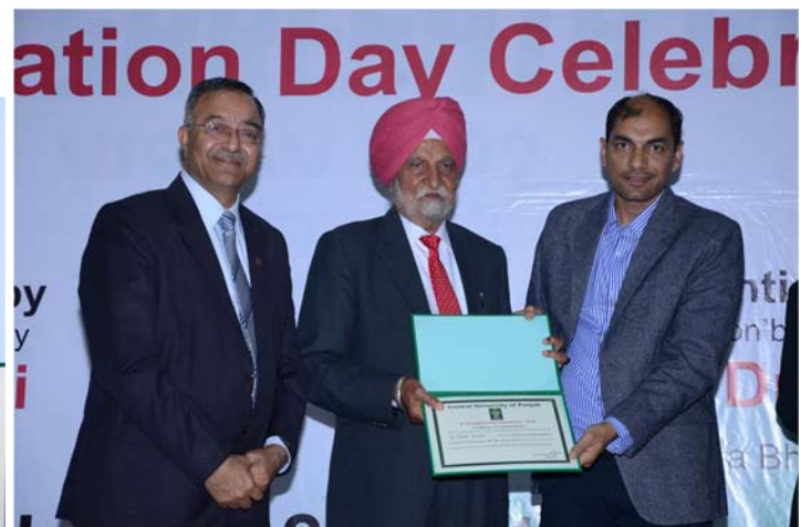
Research award Central University of Punjab, Bathinda for the year 2017 & 2018