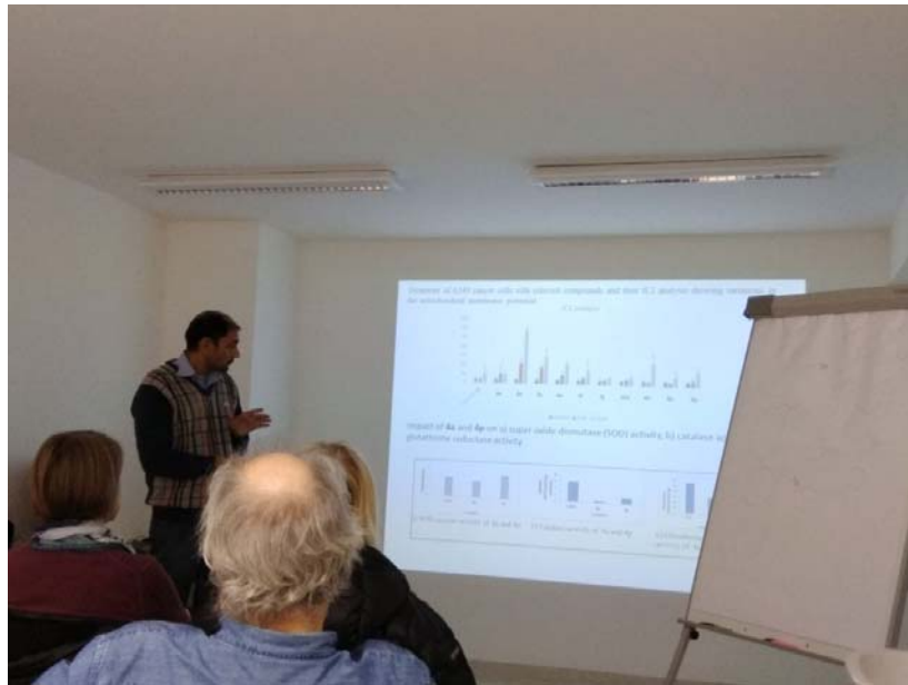
Invited Talk at Innsbruck Medical University Innsbruck, Austria