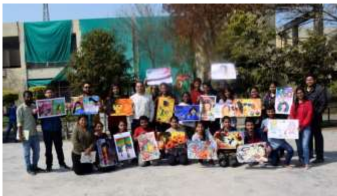
Group Picture of Participants of Poster Making - Beyond the brush Competitions

On Saturday, different Fun Games were organised like Poster Making, Face Painting, and Pot Painting. During these events, students displayed impressive Poster Presentation on the theme of Lets Stop Acid Attack, and dramatic Pottery Artwork on the theme of Women Empowerment. Besides, students also created lively face arts on a Patriotic theme.