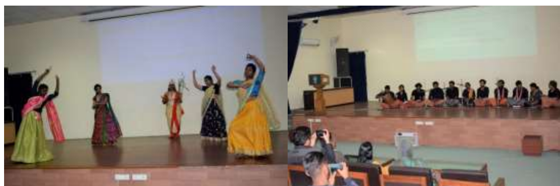
CUPB students performing Folk Dance on Telugu Song (Left) and Students singing Malayalam Song (Right)