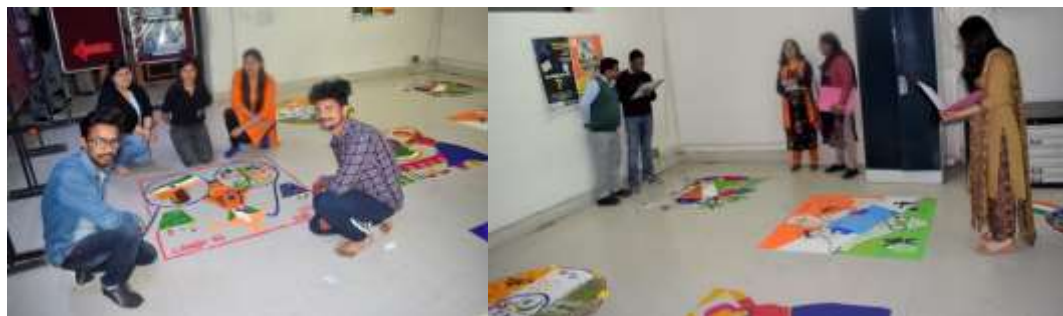
CUPB students preparing Rangoli Art Work (Left), and Judges inspecting Rangoli Designs prepared by students (Right)

On Sunday, the Ek Bharat Shreshtha Bharat Club at CUPB organised a movie screening in Telugu Language and delivered a presentation to sensitise youngsters about the culture of Andhra Pradesh to more than 120 students. On Monday, Rangoli & Best out of waste competitions were organised. In Rangoli Contest, more than 16 teams participated and created magnificent Rangoli designs on Swachh Bharat Abhiyaan, Unity in diversity, and Patriotic themes. In Best out of waste competitions, 11 teams participated and exhibited their creativity with impressive home decor items, handbags, and accessories etc. CUPB faculty and students delightfully witnessed the creative rangoli artworks and availed the opportunity to purchase innovative products prepared from waste items. Participants impressed the judges & won the hearts of spectators with their creativity in these competitions.