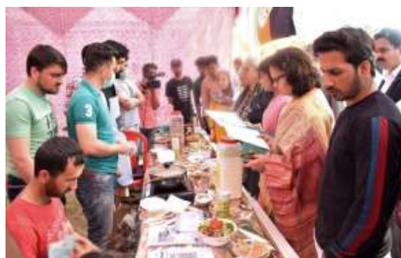
Judges inspecting Food Stalls