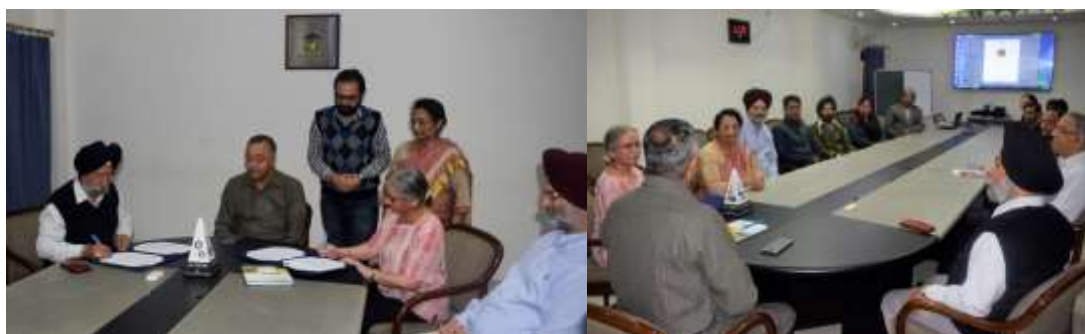
Glympse of MoU Signing Ceremony

16 th March 2020, Bathinda: Central University of Punjab Bathinda (CUPB) signed a Memorandum of Understanding (MoU) with the University of Worcester, United Kingdom to promote academic cooperation in between their “Schools of Education”. The objective of this MoU is to promote collaboration in areas of joint research, project proposals, faculty/student exchange programmes, and to share educational materials.