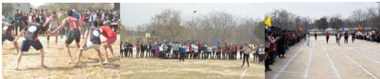
Glimpse of different sports events held during Annual Sports and Athletics Meet

presented a Mass Display performance on GOI Fit India Movement theme. During this two-day sporting extravaganza, various sports events like 50 m race, 100 m race, 200 m race, Relay Race, Shot Put, Discus Throw, and Long Jump was organised in which students enthusiastically took part & displayed their sportsmanship spirit. Apart from this, the CUPB Sports committee conducted various fun games like Sack Race, Three Leg Race, & Back Race, along with indoor gaming events like Carrom & Chess, for students, faculty and staff members.