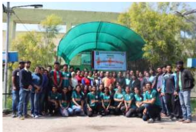
Group Photograph of Participants and Organising Team

Post-Lecture Series, CUPB NSS Volunteers, exhibited a Nukkar Natak to spread awareness about Each for Equal, & Equal world is an Enabled World.