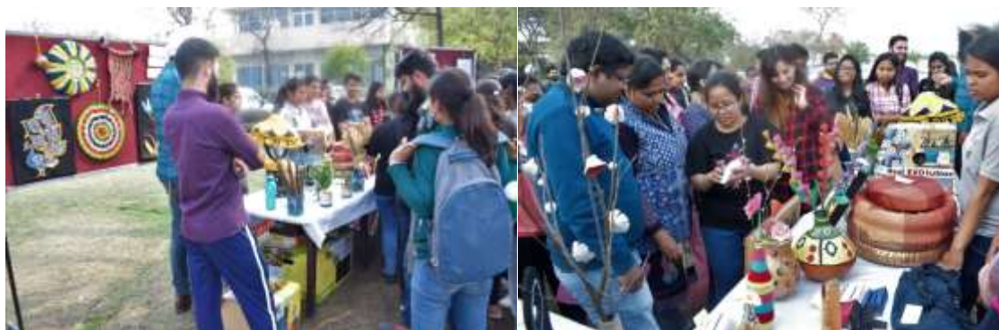
CUPB Students showcasing Best out of Waste Concepts

On Sunday, the Ek Bharat Shreshtha Bharat Club at CUPB organised a movie screening in Telugu Language and delivered a presentation to sensitise youngsters about the culture of Andhra Pradesh to more than 120 students. On Monday, Rangoli & Best out of waste competitions were organised. In Rangoli Contest, more than 16 teams participated and created magnificent Rangoli designs on Swachh Bharat Abhiyaan, Unity in diversity, and Patriotic themes. In Best out of waste competitions, 11 teams participated and exhibited their creativity with impressive home decor items, handbags, and accessories etc. CUPB faculty and students delightfully witnessed the creative rangoli artworks and availed the opportunity to purchase innovative products prepared from waste items. Participants impressed the judges & won the hearts of spectators with their creativity in these competitions.