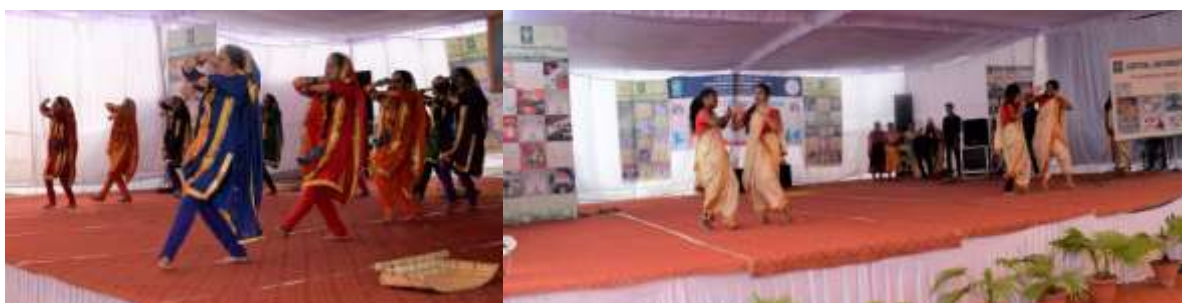
CUPB students performing Folk Dance of J&K (Left), and Folk Dance of Andhra Pradesh (Right)

Towards the end, the winners of the different programme held during the CUPB Foundation Week Celebrations were awarded. Organisers thanked the volunteers, and students for making this programme a big success.