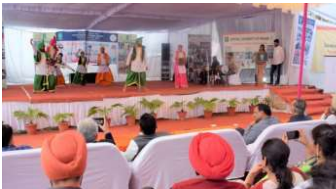
CUPB Students presenting Malwai Giddha