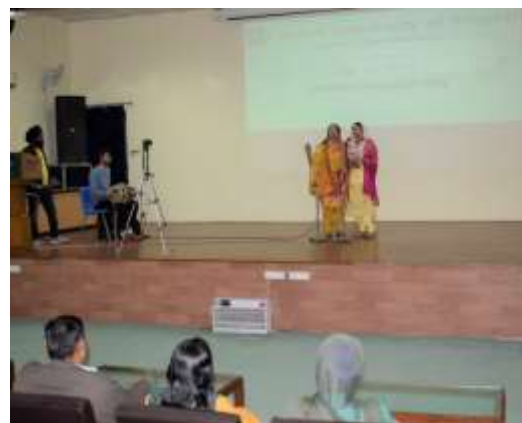
CUPB students performing Punjabi Folk Song