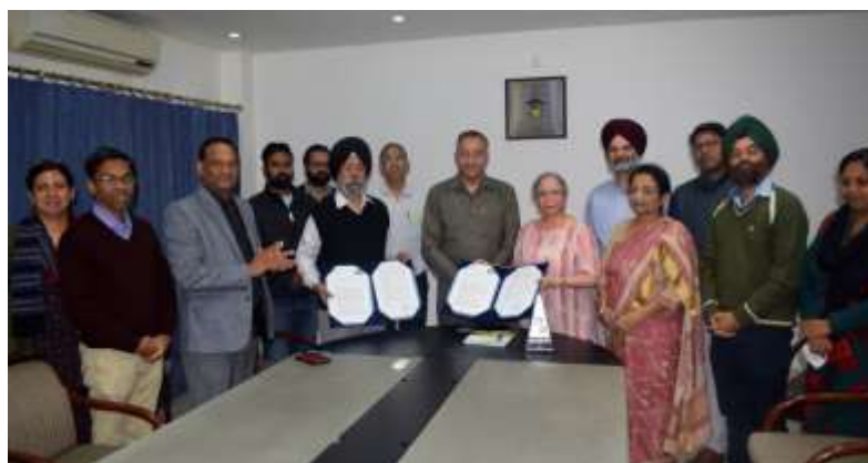
Group Picture of representative of CUPB and Univ of Worcester at the time of MoU Signing Ceremony