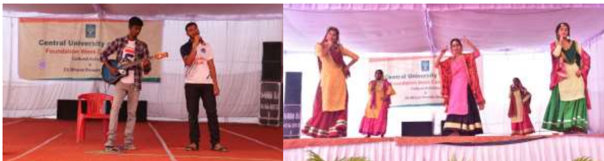
CUPB Students singing a Song (Left), CUPB students performing folk dance (Right)