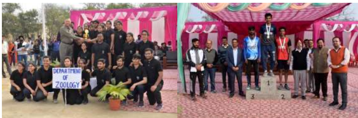
Glimpse of Award Ceremony