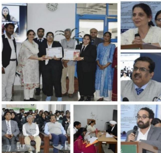
Glimpses of the Programme

The participants in the client counseling stage performed as mediators between two parties. They discussed laws relating to marriage, judicial separation, divorce, maintenance and remedies. It was deliberated that both the wife and husband are entitled to maintenance as per the material facts of the concerned case. It was informed by the judges of the event that the agreement signed between the conflicting parties during the mediation is binding to both parties.