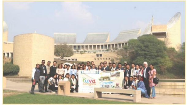
Group Photo of Yuva Sangam Manipur Contingent at Virasat-e-Khalsa Sri Anandpur Sahib