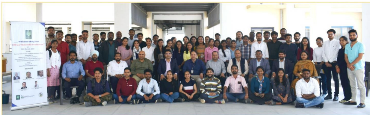
Group Photo of Participant and organizing Team Members