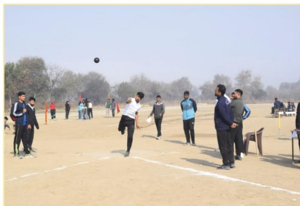
Student participating in Short Put Event