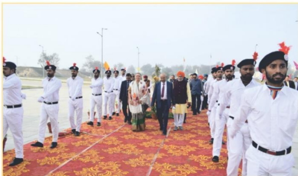
NSS Volunteers giving Guard of Honour to NAAC Peer Team