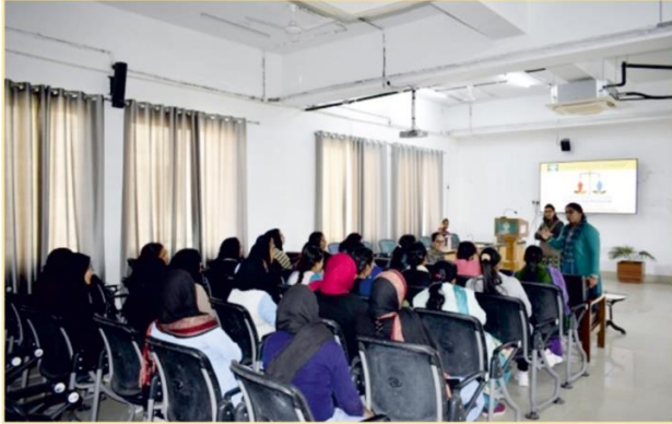
Photos of Activity of Gender Sensitization Interactive Session for outsourced female staff held on 3 rd February, 2023