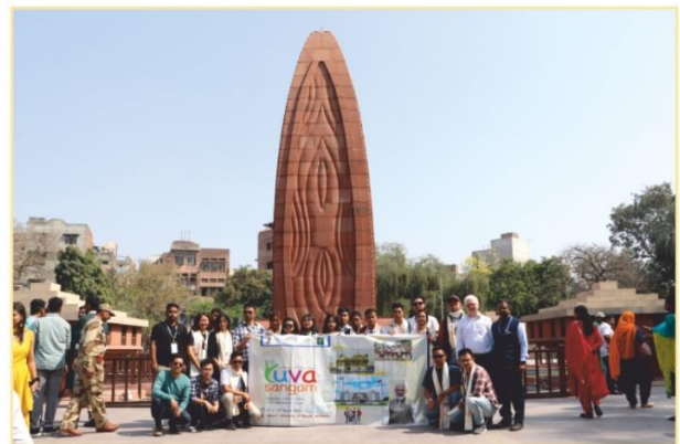
Yuva Sangam Manipur delegates at Jallianwala Bagh