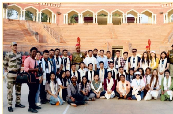
Group Photo of Manipur Students with BSF Soldiers at Hussainiwala Indo-Pak Border

In the second half, the Manipur delegates visited the National Martyrs Memorial at Hussainiwala in Punjab's Ferozepur district. The students paid rich tribute to revolutionary heroes Shaheed Bhagat Singh, Shaheed Rajguru and Shaheed Sukhdev, who were cremated there on March 23, 1931. In the evening, they attended the electrifying Indo-Pak Retreat Ceremony at Hussainiwala Border and felt patriotic after witnessing the thunderclap of robust BSF Jawans competing with their counterpart.