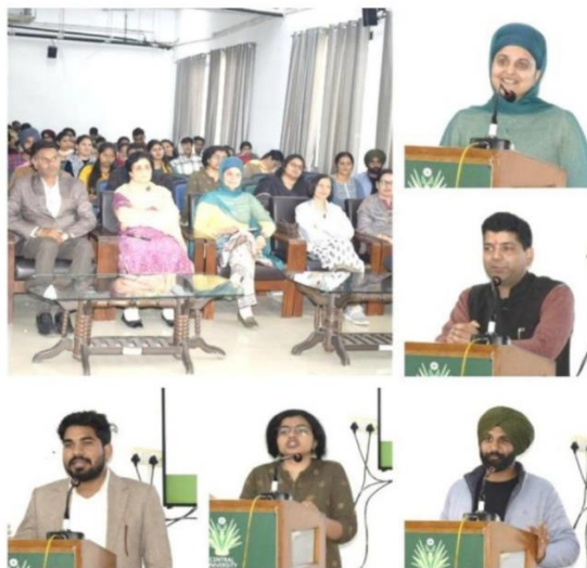
Photo Collage of Glimpses of the Programme - CUPB Matribhasha Diwas Celebrations

Apart from cultural exchange programme, a discussion session was organized in the Department of Punjabi on the theme of International Mother