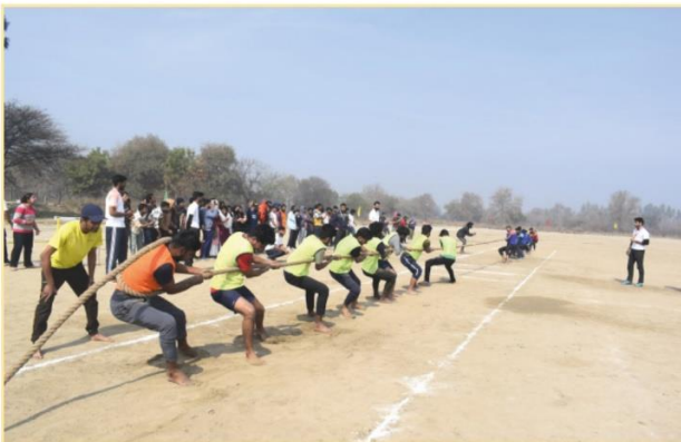
Students participating in Tug of War event