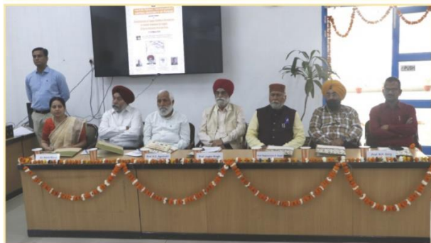
Dignitaries sitting on the dais

An ICSSR sponsored two days National Seminar on "Contributions of Sapta Sindhu Litterateurs in Indian Freedom Struggle: A Socio-historic Perspective," was held on March 27–28, 2023, at the Central University of Punjab, Bathinda (CUPB).