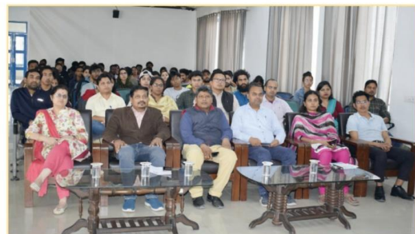
Faculty and student attending the programme

Prof. Sharda stated that approximately 89% of the water used for irrigation in India is withdrawn from approximately 20 million wells and tube wells while telling the story of groundwater and energy consumption in India. The groundwater irrigation was instrumental to the success of the green revolution. He advised farmers to shift their farming to millets and other such crops that require little water to grow, the adoption of micro irrigation technologies, and the usage of such improved varieties of rice that can be harvested in around 100 days to preserve our groundwater.