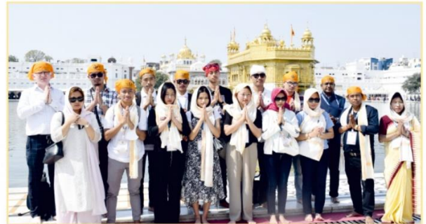
Yuva Sangam Manipur Contingent paying obeisance at Golden Temple

On 11th March, 2023, the Manipur student delegates paid obeisance at Sri Harimandir Sahib (Golden Temple) and listened to Kirtan. The students took langer together with Punjabi buddies, sitting on the ground irrespective of caste, color and creed. They also paid obeisance at Shri Durgiana Temple. Subsequently, the team visited Jallianwala Bagh and paid tribute to freedom fighters who sacrificed their lives during the freedom struggle. In the evening, the Manipur students visited the Atari-Wagha Border and attended the retreat ceremony. The ceremony was stupendous and ignited feelings of patriotism and brotherhood.