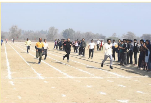
Faculty members participating in 100 meter race