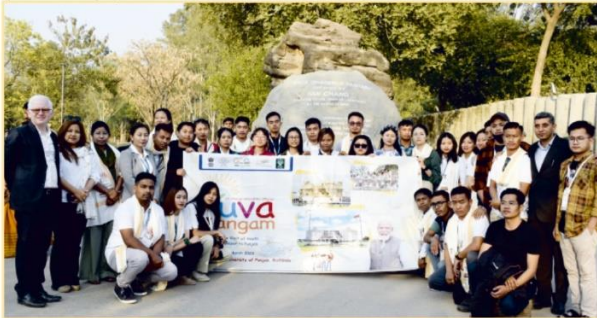
Group Photo of Manipur students at Rock Garden Chandigarh

The Manipur delegates were further fascinated to see the Rock Garden in Chandigarh, which gives the feeling of entering a small traditional Indian village representing beautifully carved huts, temples, pathways, etc.