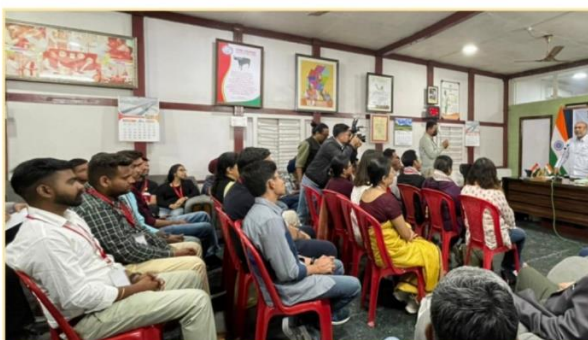
Hon'ble CM Manipur interacting with students of Punjab

The participants also shared the experience of their visit to Kangla Nongpok Thong Park, Imphal; Shri Bijoy Govindaji Temple, Imphal; Manipur Olympian Park, Sangaitheh; Marjing Complex at Heingang; Ima Keithel (the world's Largest Only Women's market);