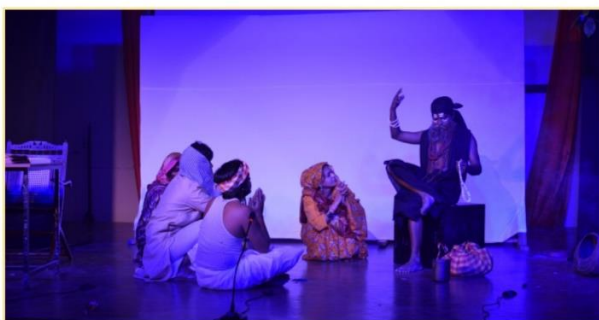
Glimpses of World Theatre Day Celebrations