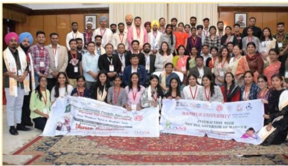
Group Photo of Punjab Students with Hon'ble Governor of Manipur