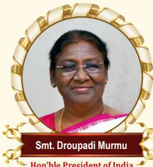
Smt. Droupadi Murmu

Hon'ble President of India & Visitor of CUPB