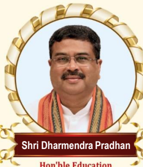
Shri Dharmendra Pradhan