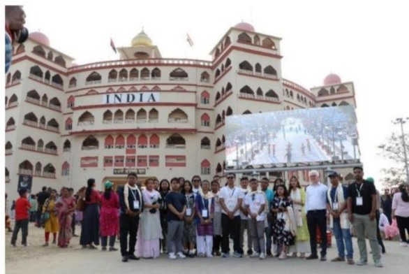
Yuva Sangam Manipur Contingent at Atari Wagha Border Retreat Ceremony