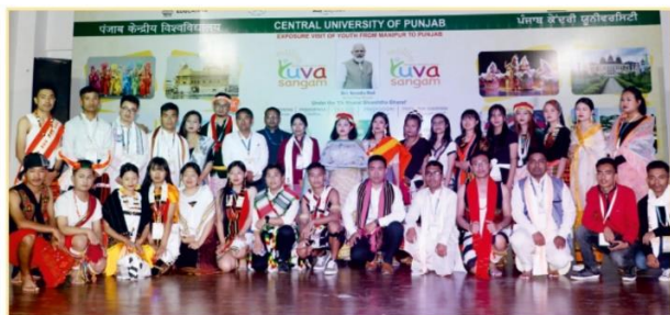
Group Photo of Manipur students in their traditional outfits

In the evening, the Yuva Sangam participants took part in a cultural program organized by CU Punjab students, where they were introduced to the folklore and culture of Punjab. During the program, the visiting students also exhibited spectacular performances to exhibit the culture and traditions of Manipur.