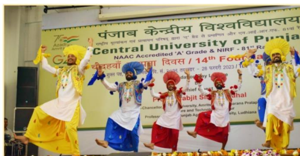
Glimpses of Cultural Programme