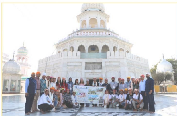
Manipur students paying obeisance at Takhat Sri Damdama Sahib

On the first day of a five-day visit (excluding the days of arrival and departure), the YUVA Sangam Manipur delegation paid obeisance at Takhat Sri Damdama Sahib. They were apprised of the historical aspect of this holy land. The Takht Sri Damdama Sahib, one of the five seats of temporal authority in Sikhism, is the place where Guru Gobind Singh, the tenth Sikh Guru, prepared the full version of the Sikh scriptures, called Sri Guru Granth Sahib, in 1705.