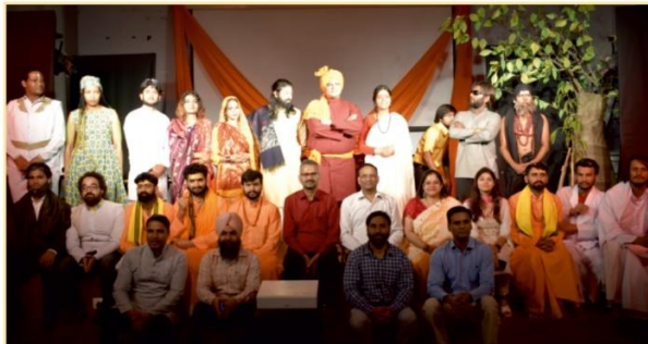
Glimpses of CUPB World Theatre Day Celebrations 2023