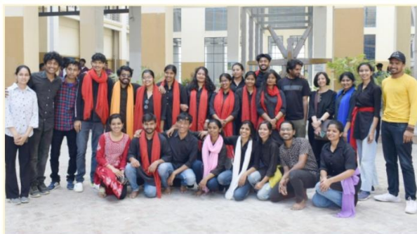
Group Photo of students who performed Nukkad Natak