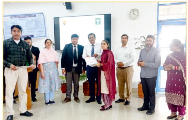
Organizers distributing prizes to the Winners