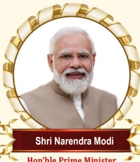
Shri Narendra Modi

Hon'ble President of India & Visitor of CUPB