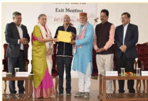
National Assessment and Accreditation Council Peer Team Visits Central University of Punjab