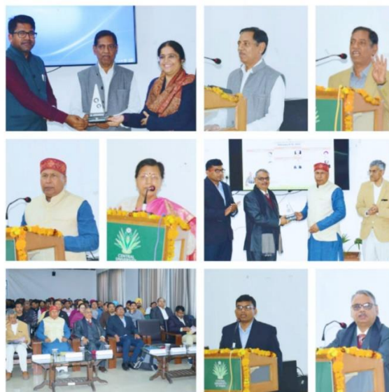
Photo Collage of Glimpses of the Workshop

imparted training on Diagnosis tests & Remediation techniques.