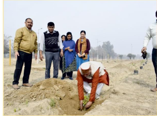
Vice-Chancellor planting tree sampling during Plantation Drive held on 17 th February, 2023