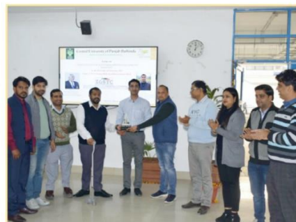
Faculty of Dept of Pharmacology felicitating the invited speaker

preclinical screening model to bridge the gap between human and rodent pathology, as rats and mice are widely used preclinically.