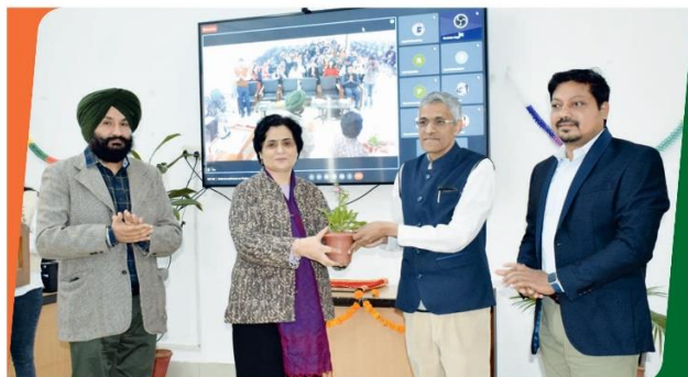
Glimpses of Inaugural session of this conference

The Central University of Punjab in collaboration with AIIMS Bathinda and Indian National Young Academy of