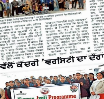
केंद्रीय विश्वविद्यालय में हिंदी कैम्पस कविता कार्यक्रम आयोजित।