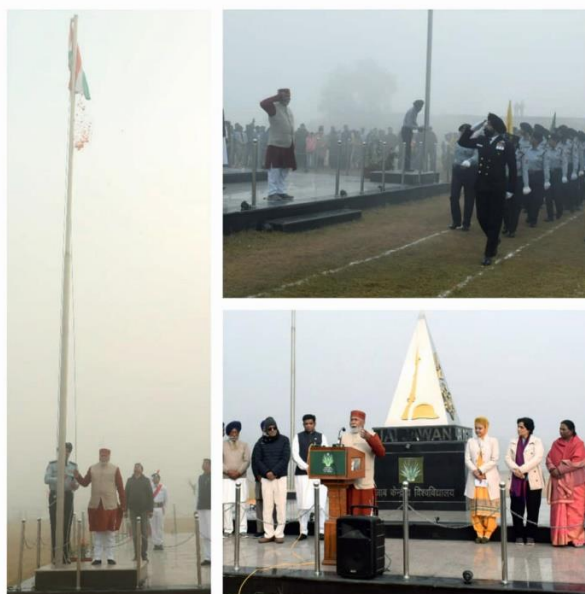
Photo Collage of CUPB Republic Day Celebrations

apply their wisdom in their actions. He inspired the university fraternity to work hard to make CUPB a preferred destination for quality education and research.