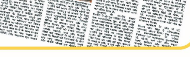
पंजाब केंद्रीय विश्वविद्यालय में श्री गुरु गोविंद सिंह जी के जीवन और शिक्षा विषय पर व्याख्यान कराया।