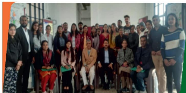
Group Photo of the participants and Programme Organizers