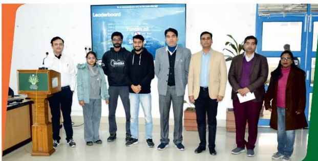
Group Photo of CUPB Officials with the Winners of Quiz Competition

The Central University of Punjab organized a Quiz Competition on 'Life and Contribution of Netaji Subhash Chandra Bose'. Around 103 students from different departments participated in this competition. The university has conducted this competition as per the directions of UGC to select one deserving student who will get an opportunity attend the Floral Tribute Functions at the Central Hall of the Parliament of India on 23rd January, 2023, the birth anniversary of Netaji Subhash Chandra Bose.