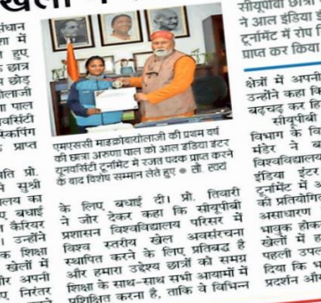
जयस बहिष्कार: शिक्षा और अनुसंधान के क्षेत्र में उत्कृष्टता को दिखाने में आगे बढ़ने का प्रयास करते हुए पंजाब केंद्रीय विश्वविद्यालय की छात्रा ने एआईयू खेलों में रजत पदक जीता।