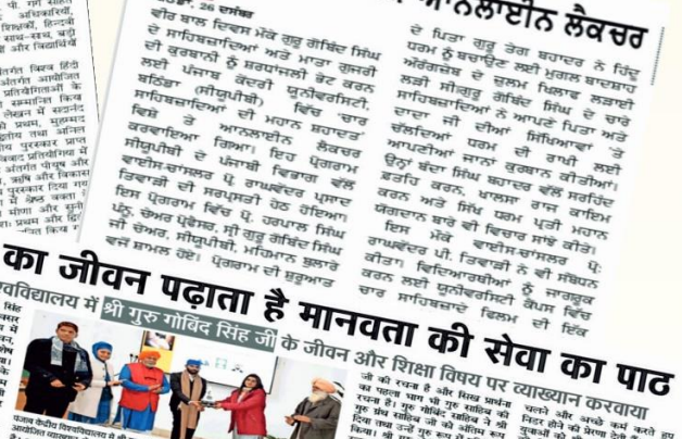
गुरु जी का जीवन पढ़ाता है मानवता की सेवा का पाठ।