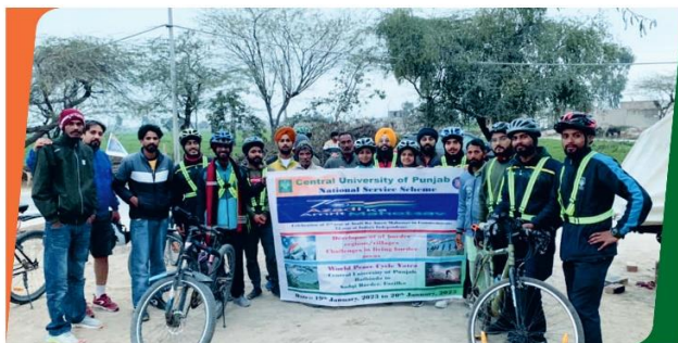
Group Photograph of participants of World Peace Cycle Yatra

A team of cyclists from the Central University of Punjab successfully concluded a 'World Peace Cycle Yatra' from