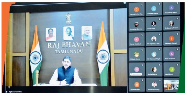
Hon'ble Governor of Tamil Nadu Shri Ravinder Narayan Rav addressing the participants

Aiming to explore the pathways for the holistic and multi-disciplinary growth of Indian languages, the Central University of Punjab, Bathinda (CUPB), in association with Bharatiya Bhasha Smiti, Ministry of Education, Government of India, organized the inaugural ceremony of a two-day National Seminar entitled "Inter-dialogue in Indian Languages: Present Condition and Way Forward" on December 11, 2022.