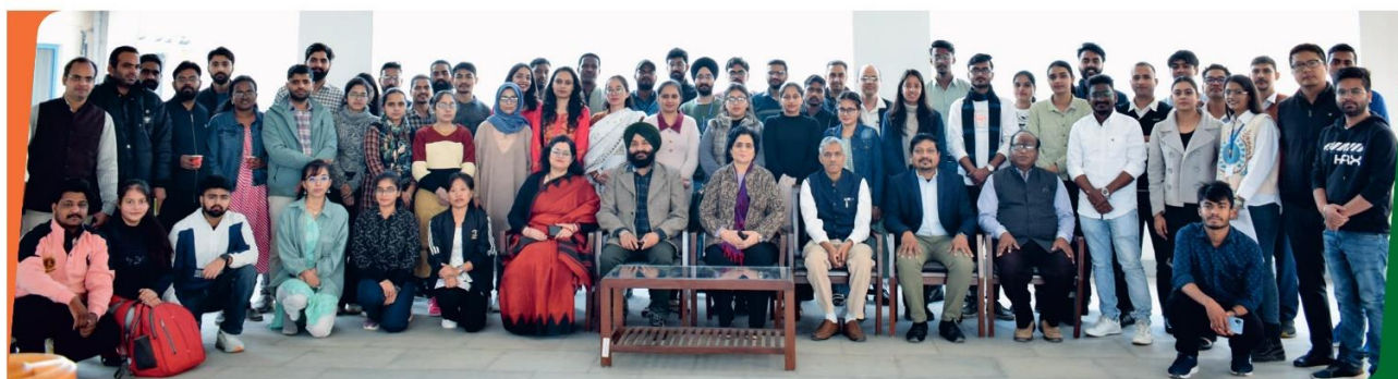
Group Photo of Participants and Organizer