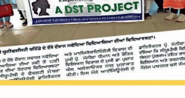
विद्यार्थियों को 'वैज्ञानिकों' के लिए प्रेरणा देना।