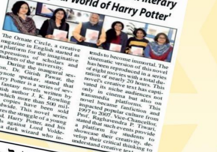
The Ornate Circle, a creative platform for the imagination of the scholars and students of the university.