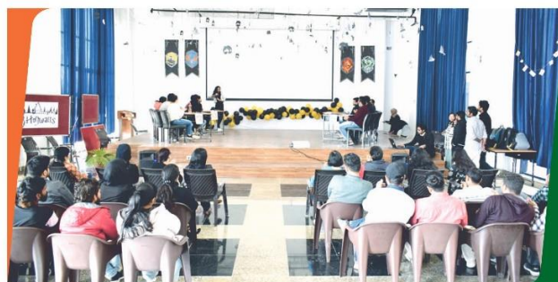
CUPB students participating in competitive events