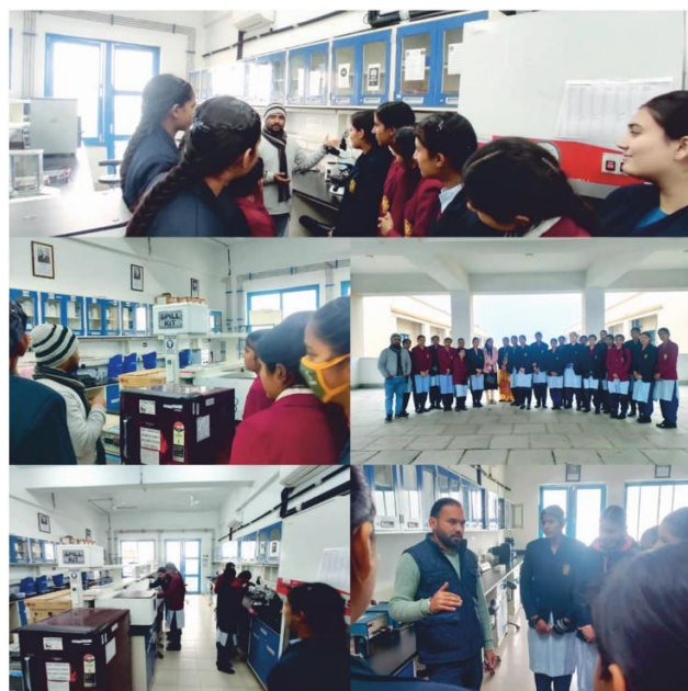
School students visiting CUPB Research Labs under Vigyan Jyoti Scheme

To encourage the girl student(s) of Navodaya Vidyalaya to pursue higher education and career in Science, Technology, Engineering and Mathematics (STEM) fields, the Central University of Punjab invited students of four Jawahar Navodaya Vidyalaya to visit research labs situated at the CUPB campus.