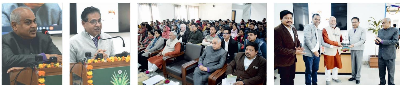
Photo Collage of Glimpses of the programme