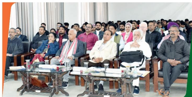
CUPB fraternity attending the lecture of Governor of Tamil Nadu Shri R.N. Ravi

Addressing the participants through virtual mode, the Hon'ble Governor of Tamil Nadu and the Chief Guest of the programme, Shri Ravinder Narayan Ravi, stated that the Bharatiya Bhasha Utsav is a tribute to Mahakavi Subramania Bharati, who was regarded as the bridge between the North and the South during his time. Observing his Jayanti as Bharatiya Bhasha Utsav would once again strengthen the national unity. He stated that the topic of this seminar is relevant in the present context as Bharatiya culture always possesses the beauty of unity in diversity where people living together while adopting their native mother tongue, showing respect for each other's thoughts and working unanimously for the welfare of humanity. The deliberations of this seminar would help in devising a roadmap to restore India's supremacy in the world as a Vishwaguru through inclusive development and integrated effort.