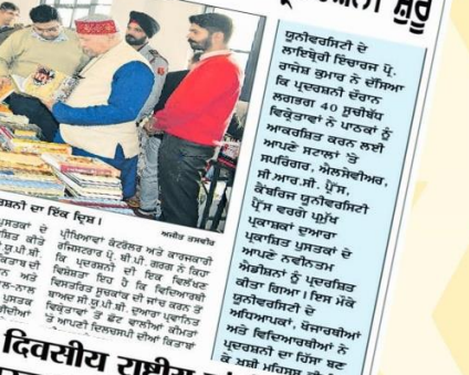
पंजाब वेंचर यूनिवर्सिटी (एच.ए.ए.ए.) ने 11वीं पुसउक प्रसन्नती लुतु।

पंजाब वेंचर यूनिवर्सिटी (एच.ए.ए.ए.) ने 11वीं पुसउक प्रसन्नती लुतु। इस अवसर पर विद्यार्थियों को प्रोत्साहित किया गया।