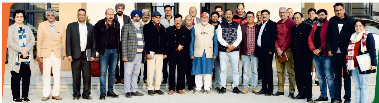
Group Photograph of CUPB Officials and Industry Representatives