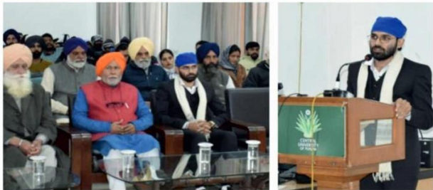
ਪ੍ਰੋਗਰਾਮ ਦੀ ਝਲਕੀਆਂ ਦੀ ਫੋਟੋ ਕੋਲਾਜ਼