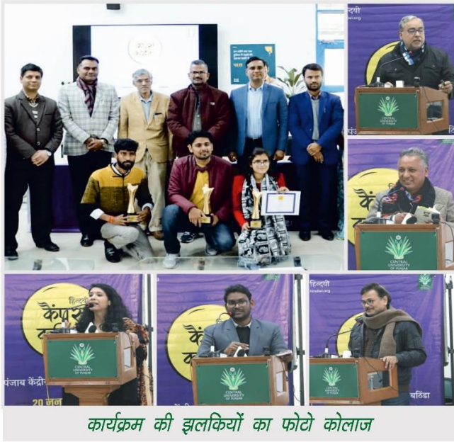
कार्यक्रम की झलकियों का फोटो कोलाज

स्त्री-शिक्षा और विधवा-विवाह पर विशेष बल दिया। उन्होंने बताया कि पंजाबी सीखने वालों को फिल्लौरी जी की पहली रचना 'पंजाबी बातचीत' अवश्य पढ़नी चाहिए। इस पुस्तक में पंजाब के विभिन्न क्षेत्रों की बोलियों, जातियों, सभ्यता और संस्कृति को विस्तार से बताया गया है। इसे साक्षात्कार विधा की पहली पुस्तक भी माना जाता है। इसके साथ ही उन्होंने बताया कि फिल्लौरी जी के करीब डेढ़ दर्जन रचनाओं के साथ ही फिल्लौरी ग्रंथावली का भी प्रकाशन हो चुका है।