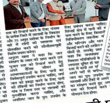
मूजल सार के लिए रिचार्ज-3 नियम पर एक प्रिक्लामेरी टिप्पणी-3 प्रिक्लामेरी अद्युक्त किया गया।

सेक्टर युनिवर्सिटी आम पंजाब के 'मूजल' विभाग के केंद्रीय मूजल बोर्ड (सीजीडब्ल्यू), उत्तर पश्चिम क्षेत्र, चंडीगढ़ की ओर से मूजल सार पर जल उद्योगों के लिए रिचार्ज-3 नियम पर एक प्रिक्लामेरी टिप्पणी-3 प्रिक्लामेरी अद्युक्त किया गया। इस प्रिक्लामेरी में बताया गया है कि मूजल सार के लिए रिचार्ज-3 नियम पर एक प्रिक्लामेरी टिप्पणी-3 प्रिक्लामेरी अद्युक्त किया गया।