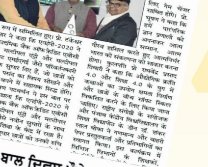
यूरोपीयों में दो दिवसीय राष्ट्रीय संगोष्ठी के उद्घाटन समारोह में प्रख्यात शिक्षाविदों ने भाग लिया।