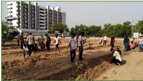
Tree Plantation Drive on June 26, 2022 at Entrance of Mata Gujri Girls Hostel and Rani Lakshmi Bai Girls Hostel, CUPB