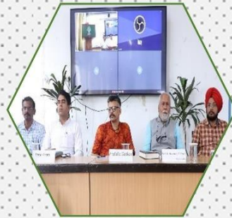
Panel Discussion on Modi@20-Dreams Meet Delivery– Page No. 7--11