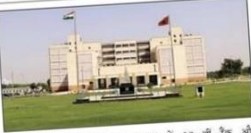
पंजाब केन्द्रीय विश्वविद्यालय, बडिंडा

मुख्य न्यूज़/बीकानेर बडिंडा, 16 जुलाई : पंजाब केन्द्रीय विश्वविद्यालय, बडिंडा (सीयूपीबी) ने विश्व रैंकिंग 2022 में विश्वविद्यालय श्रेणी में 81वां स्थान प्राप्त किया है। इस रैंकिंग में विश्वविद्यालयों को 100 विश्वविद्यालयों में से रैंकित किया गया है। विश्वविद्यालयों को रैंकित करने के लिए एनआईआरएफ इंडिया रैंकिंग 2022 की फार्मसी श्रेणी में भी 26वां स्थान हासिल किया गया है।