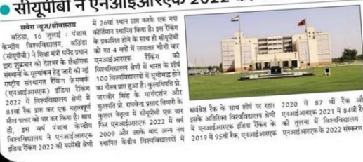
पंजाब केन्द्रीय विश्वविद्यालय, बटिंडा का दृश्य। यह विश्वविद्यालय एनआईआरएफ 2022 में विश्वविद्यालय श्रेणी में 81वां स्थान और फार्मसी श्रेणी में 26वां स्थान हासिल किया।

सीयूपीबी ने एनआईआरएफ 2022 की फार्मसी श्रेणी में भी 26वां स्थान हासिल किया