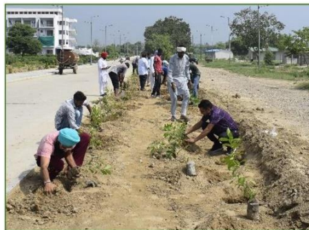
Tree Plantation Drive on July 16, 2022 in front of Rose Garden, CUPB