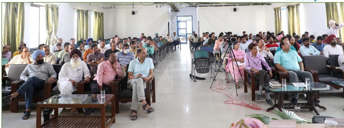
CUPB faculty and students attending the program