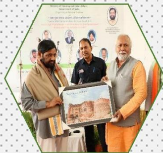
National Seminar on Nasha Mukt Samaj Andolan– Page No. 5--7