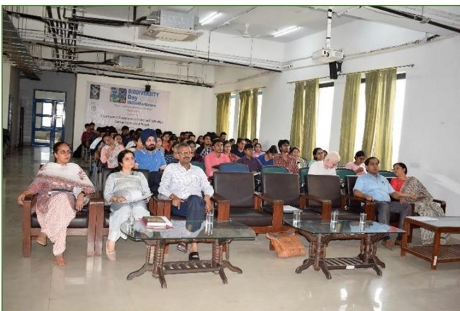
CUPB fraternity attending the program