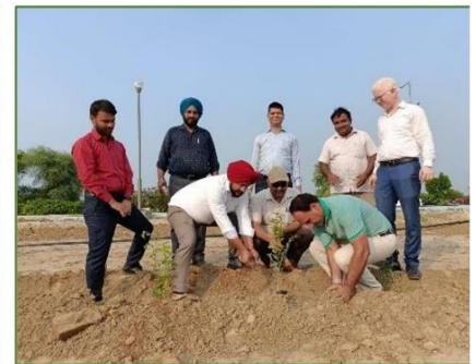
Tree Plantation Drive on July 18, 2022 near Gate Number 1 of CUPB Campus