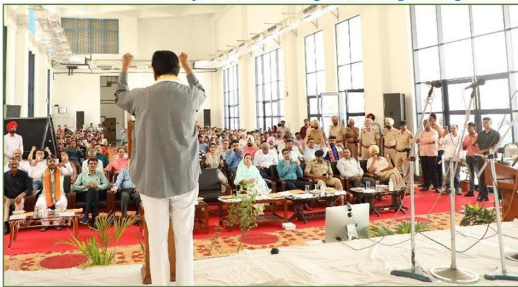
The Minister of State Shri Kaushal Kishore has appealed everyone to work for making a drug free society