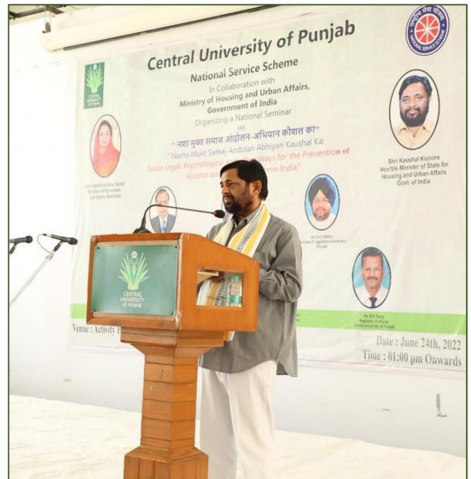
Hon'ble Minister of State for Housing and Urban Affairs Shri Ksuahal Kishore addressing the participants

youngsters to enjoy addiction to good habits and stay away from drug abuse.