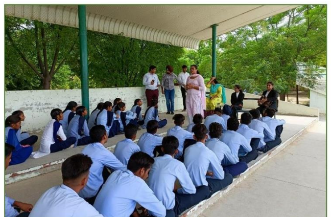
Glimpse of Legal Literacy Camp organized in Govt School Nandgarh

teasing under Section 354/506 of IPC, sexual harassment under the Sexual Harassment of Women at Workplace (Prevention, Prohibition and Redressal) Act, 2013 and domestic violence against women under Protection of Women against Domestic Violence Act 2005. They enlightened participants about the Compensatory Scheme run by the Govt. of Punjab for the victim or his/her dependents who have suffered loss or injury as a result of the crime and who require rehabilitation by the Legal Services Authorities.