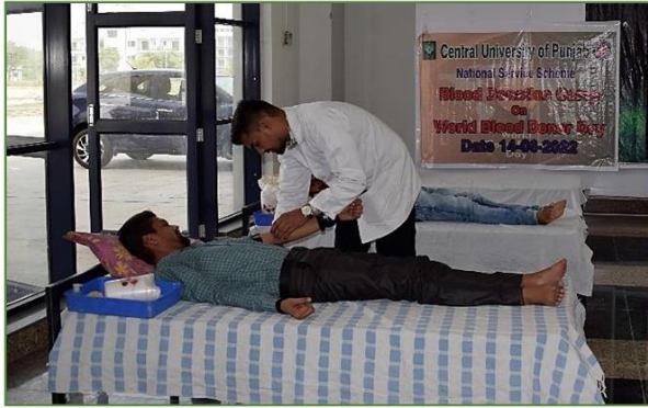
CUPB faculty and students participating in Blood Donation Camp organized on June 14, 2022