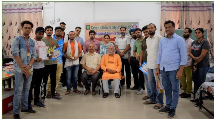
Group Photo of the Vice-Chancellor Prof. Tiwari with Blood Donors during the Blood Donation Camp on June 14, 2022