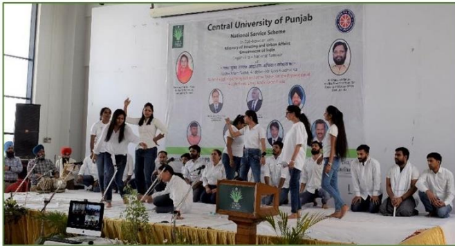
CUPB Students performing Laghu Natika on Drug Abuse

On this occasion, CUPB students presented a laghu natika, "An Awareness Show on Addiction."