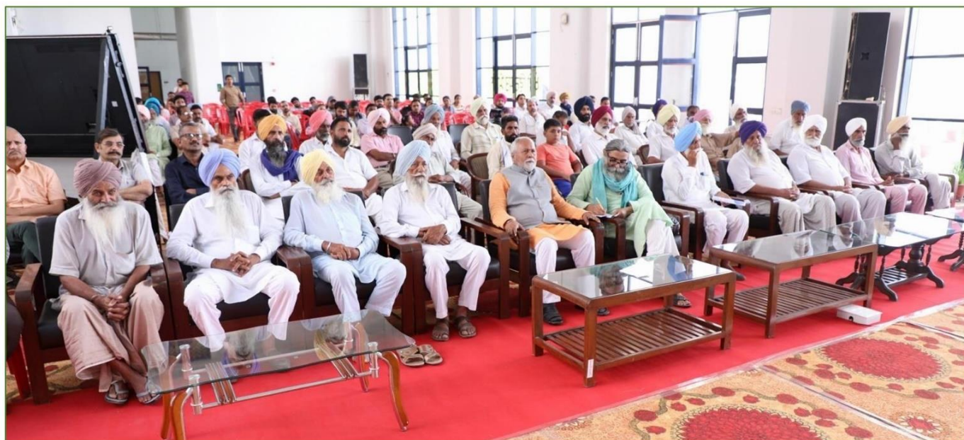
CUPB Vice-Chancellor and distinguished guests attending the programme along with farmers