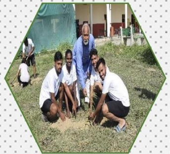
Environment Conservation Initiatives – Page No. 23