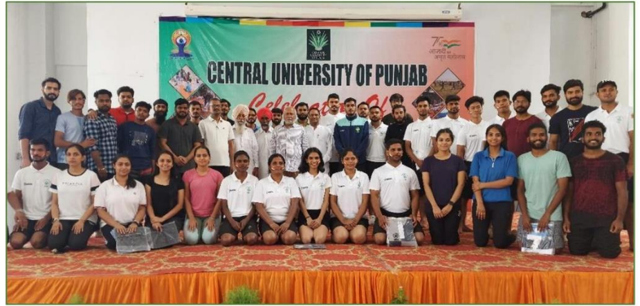
CUPB students delivering Yoga Pyramid performance (left) and Group Photograph of Winners of different activities organized on the occasion of Int. Day of Yoga Celebrations (Right)