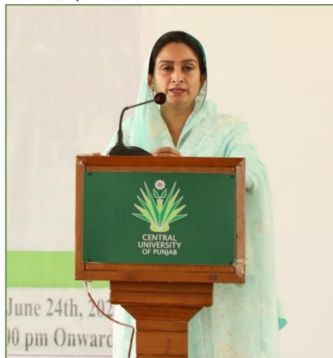
Smt. Harsimrat Kaur Badal, Member of Parliament, Bathinda Lok Sabha Constituency, sharing her views