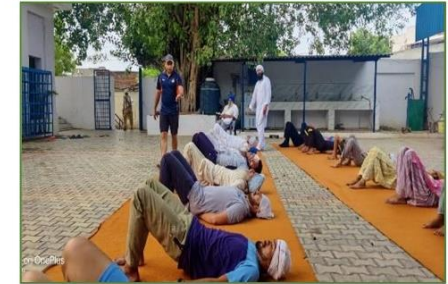
Glimpses of Social Outreach Programme on ‘Yoga and Health’ conducted at Gurudwara Sahib, VPO hudda, Dist. Bathinda