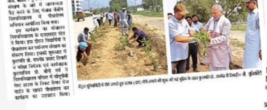
पंजाब केन्द्रीय विश्वविद्यालय में गुलामोहर, सुखदेव चोदनी व गुडहल के पौधे लगाए गए