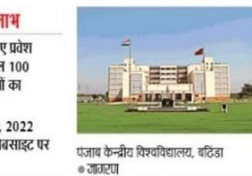
पंजाब केन्द्रीय विश्वविद्यालय, बडिंडा

जार्ज, बडिंडा : पंजाब केंद्रीय विश्वविद्यालय (सीयूपीबी) अंतर्गत जाति के विद्यार्थियों को संचालित सेवा आयोग (यूपीएससी) के सिविल सेवा परीक्षा के लिए निःशुल्क कोचिंग प्रदान करेगा। इसके लिए विश्वविद्यालय में विद्यार्थियों को लाभ