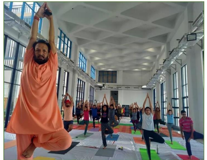
Glimpses of Alternate Therapy Workshop

During this seven-day workshop experts from different areas spoke and also took practical sessions on Nadi