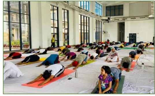
Glimpses of CUPB students and faculty members participating in Yoga Camp