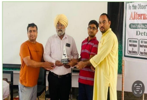
Poster of Herbal Medicine Session (Left) and Programme Organizers felicitating the distinguished speaker (Right)