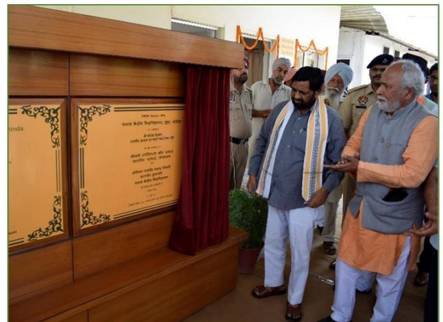
Hon'ble Minister of State for Housing and Urban Affairs Shri Kaushal Kishore inaugurating the Legal Aid Centre at Central University of Punjab launched with the aims to help the needy persons

July 13, 2022: Central University of Punjab organized legal literacy camp for students of students of Govt. Senior Secondary School, Ghudda and Govt. Sports Sr. Sec. School, Ghudda.