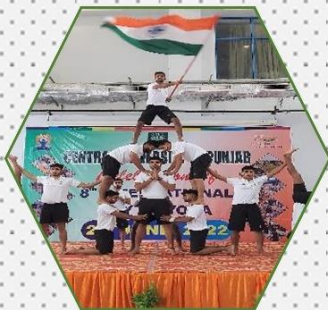
International Day of Yoga 2022 Celebrations– Page No. 12--17