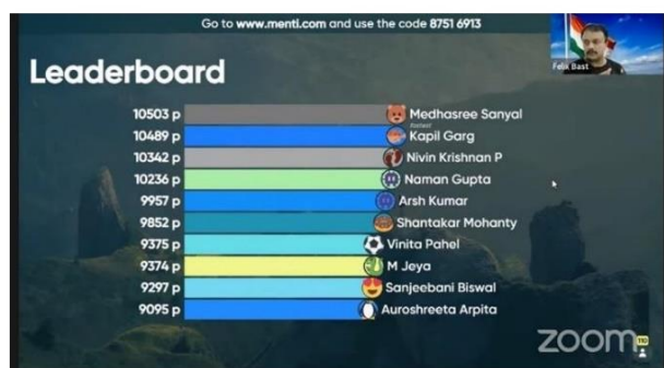
Screenshot of the Leaderboard