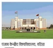
पंजाब केन्द्रीय विश्वविद्यालय, बटिंडा का दृश्य।

● निशुल्क कोचिंग के लिए प्रवेश परीक्षा के माध्यम से कुल 100 अनुसूचित जाति के छात्रों का किया जाएगा चयन ● इसका अन्वेषी 15 जून, 2022 तक विश्वविद्यालय की वेबसाइट पर आवेदन कर सकते हैं