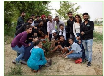
Dept. of Geology Students planting tree saplings at CUPB Campus on their farewell on June 28, 2022