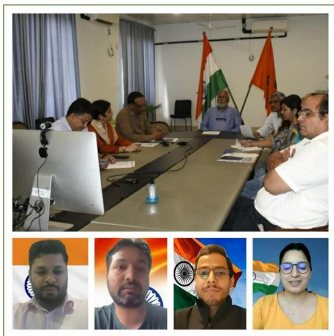
Glimpses of CUPB Alumni Meet 2022