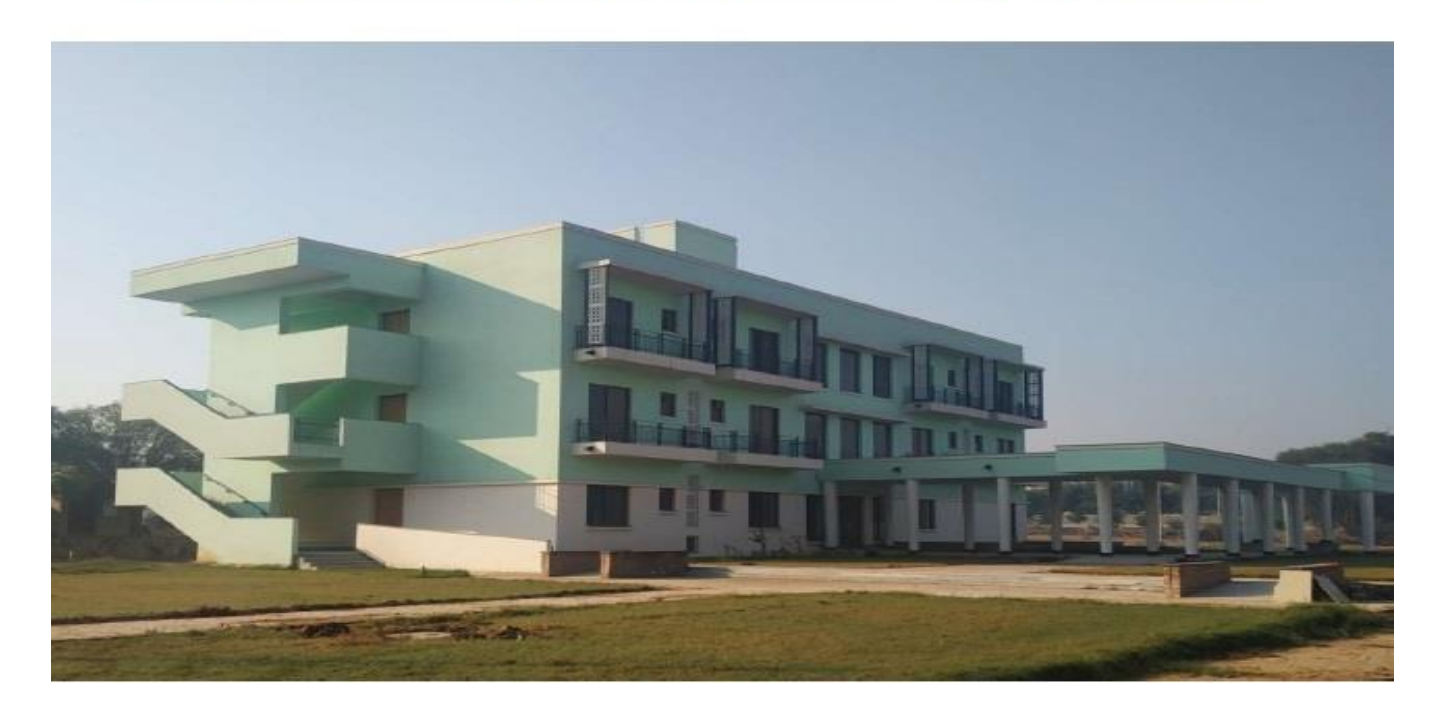
SWAMI VIVEKANAND TRANSIT HOSTEL