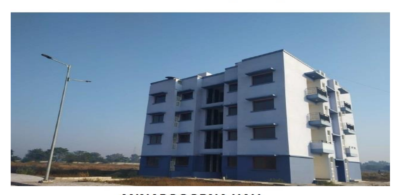
ANNAPOOORNA HALL (STUDENT DINING BLOCK)