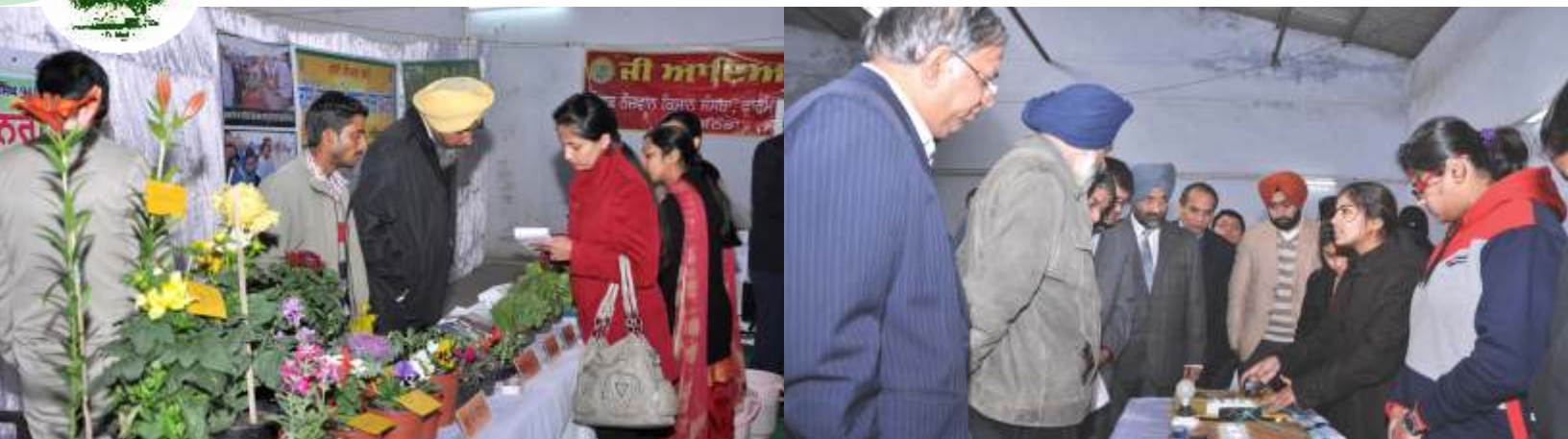
Colourful exhibition of plants, models being inspected by visitors and the Vice Chancellor