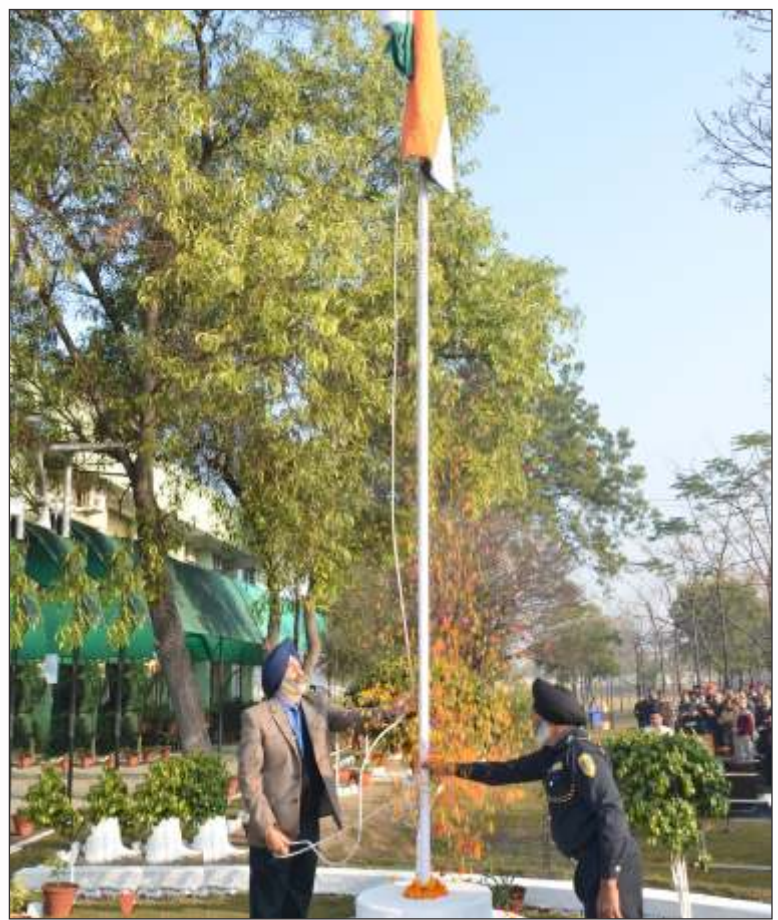
Vice Chancellor hoisting the national flag