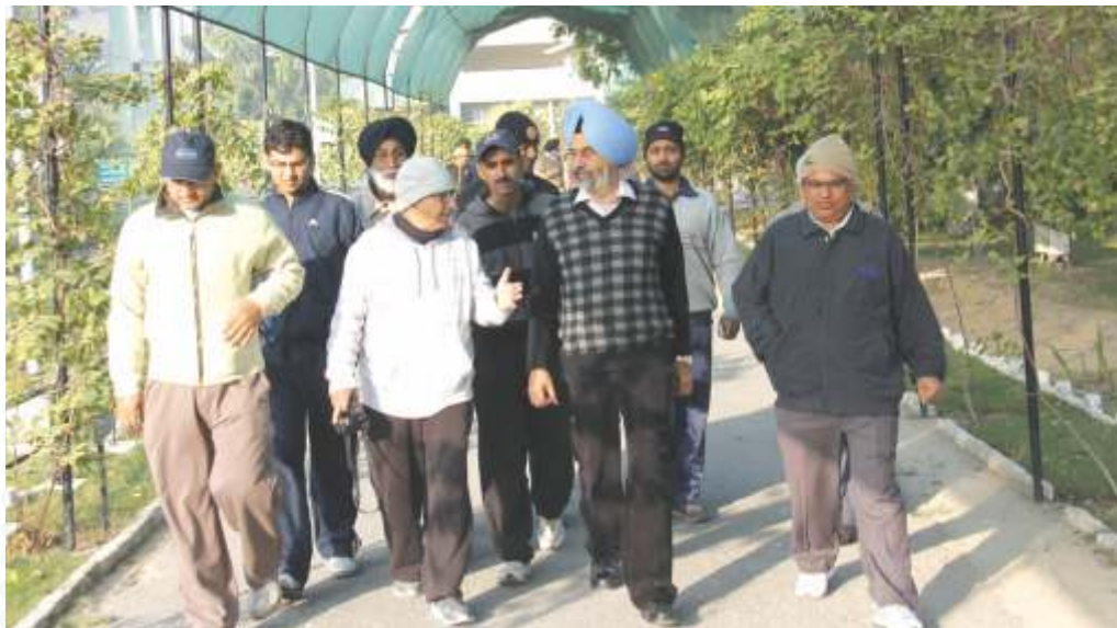
Bathinda Cycle Club members during their visit

A group of citizens of Bathinda, under the auspices of Bathinda Cycle Club, visited the university on the occasion of World Energy Conservation Day on December 14, 2013 riding their bicycles seeking awareness about the development activities of the university. The visitors were informed of the cultural, social, literary and scientific programmes undertaken for the overall improvement of the students and the faculty and also for the community of the region by the university. The visitors appreciated these efforts and promised support to such programmes for community development in the region.