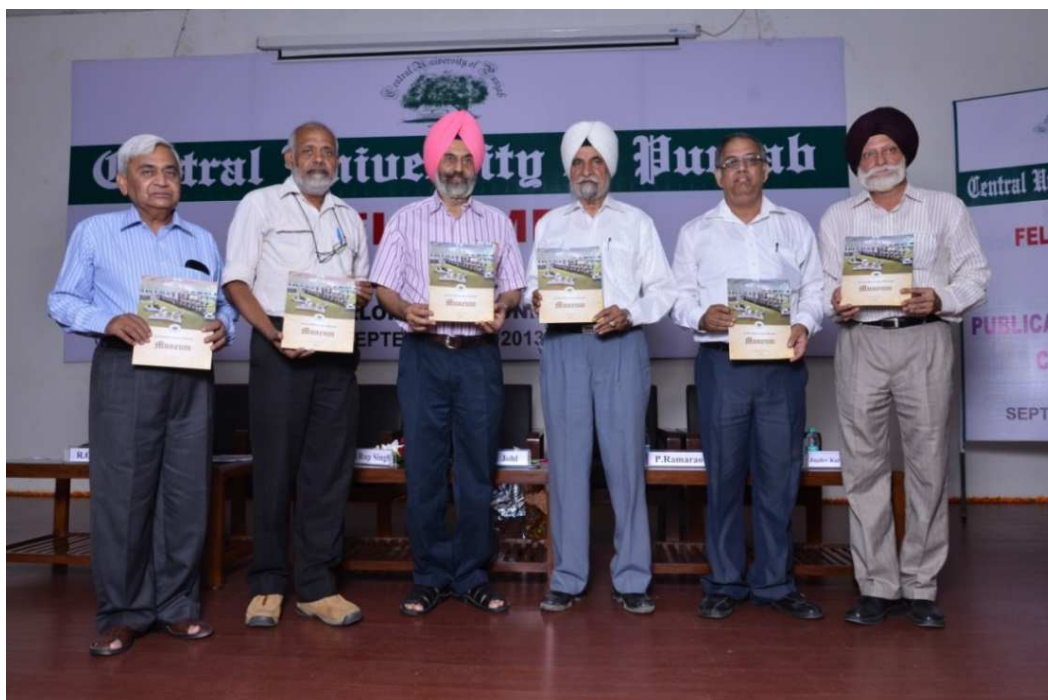
The Chancellor releasing the museum brochure