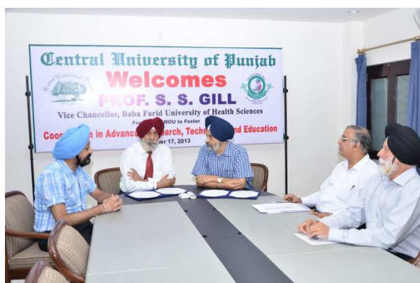
Signing of MoU with BFUHS