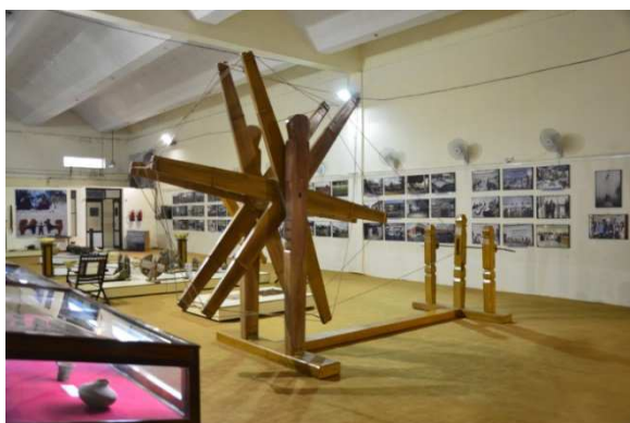
Large Sized Spinning Wheel

In order to provide continuous updates, high density LED screens have been installed at several places including the museum and waiting areas. Pedestals and display platforms have been added in the museum. Along with this a large sized spinning wheel of dimensions 17x11x7 feet has been displayed at the University Museum. It is probably the largest functioning spinning wheel in the country.