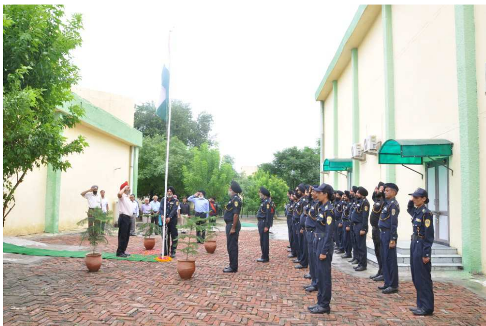
The Vice Chancellor unfurling the national flag