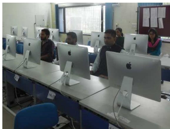
i Mac Section in the Computer Centre

A new air-conditioned reading room has been provided to students for use of their personal books and accessing internet on their laptops through Wi-Fi.