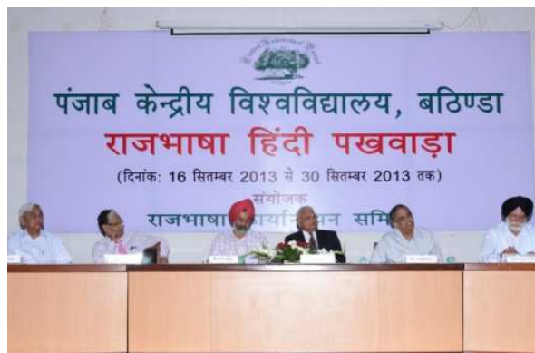
Panellists on the Dais