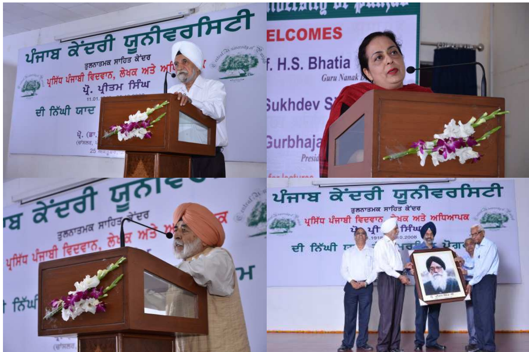
Glimpses of the Programme