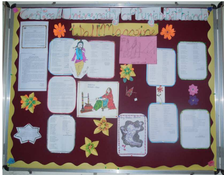
Wall Magazine on Display