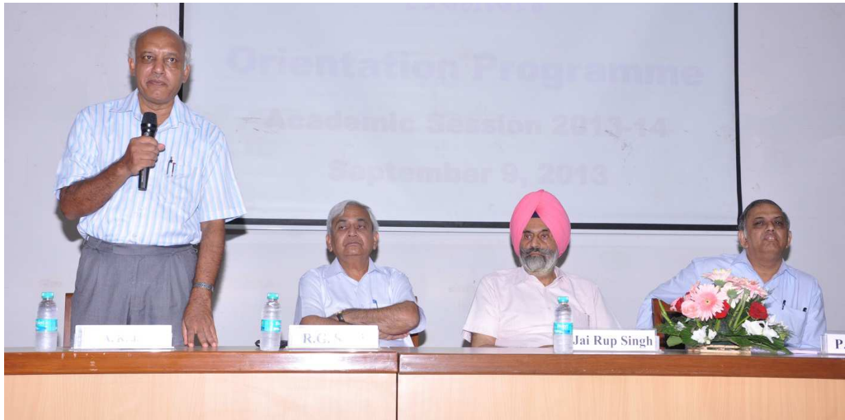
Faculty members introducing themselves during the Orientation

An orientation programme for students admitted to academic session 2013-14 marked the inauguration of the new session in the university on September 8, 2013. The faculty members were introduced to the new entrants by the respective Centre Coordinators. Toppers of the academic session 2012-13, who had excelled in their respective courses and office bearers of the student council, also introduced themselves.