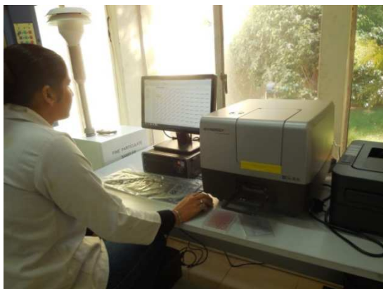
Synergy H 1 Microplate Reader