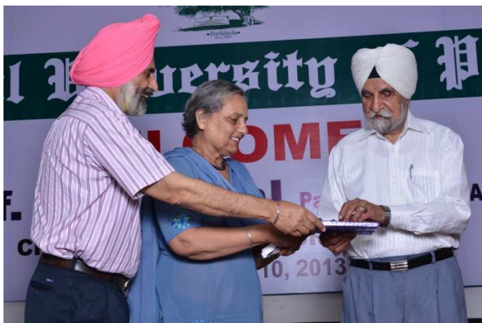
Chancellor releases the book on insects