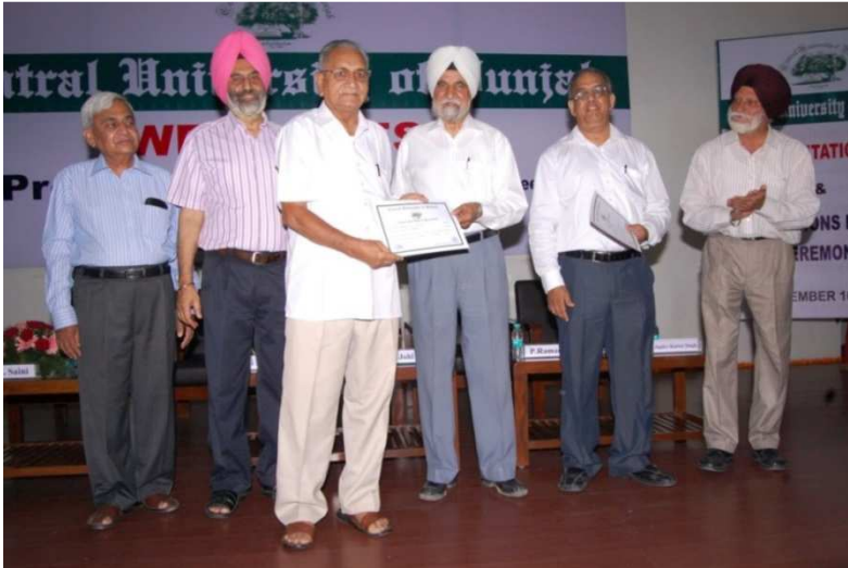
Senior citizens receiving the certificates from the Chancellor

The university had initiated complimentary computer literacy classes for the Senior Citizens of Bathinda city with an aim of teaching them the basics of computers to enable them to do simple tasks on computers and get connected to their kith and kin through cyber space. Forty nine citizens were benefitted by the programme. These senior citizens were given certificates during a special ceremony organised on September 10, 2013 in the University Auditorium.