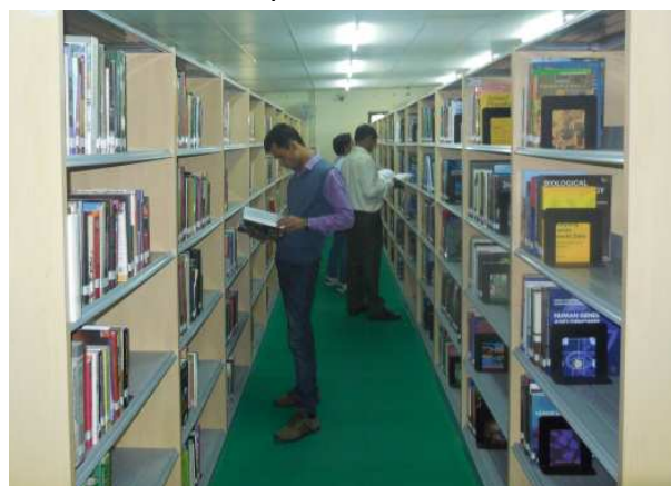
Extension of the Library

A new section of Apple computers with 15 i Macs and other 100 computers have been added to the Computer Centre.