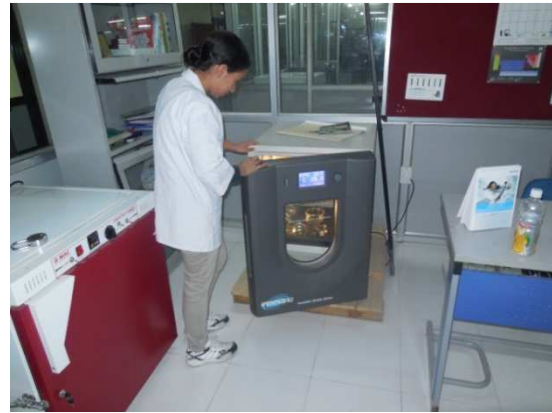
Digital Incubator Shaker