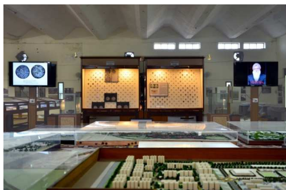
LED Screens Installed in the Museum