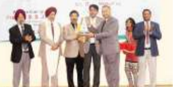
विद्युत युनिवर्सिटी ऑफ पंजाब में 11वां स्थापना दिवस मनाया गया