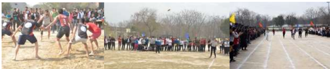
Glymipse of different sports events held during Annual Sports and Athletics Meet

The inaugural ceremony got off to a flying start with the hoisting of University Flag, Torch Lighting, and an impressive March Past by CUPB students. On this occasion, CUPB students presented a Mass Display performance on GOI Fit India Movement theme. During this two-day sporting extravaganza, various sports events like 50 m race, 100 m race, 200 m race, Relay Race, Shot Put, Discus Throw, and Long Jump was organised in which students enthusiastically took part & displayed their sportsmanship spirit. Apart from this, the CUPB Sports committee conducted various fun games like Sack Race, Three Leg Race, & Back Race, along with indoor gaming events like Carrom & Chess, for students, faculty and staff members.