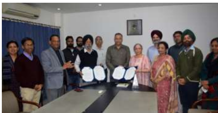
Group Picture of representative of CUPB and Univ of Worcester at the time of MoU Signing Ceremony