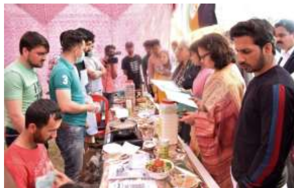
Judges inspecting Food Stalls

Some of the exclusive food items of this carnival was Hydrabadi Biryani, Kabuli Pulao, Bulani,