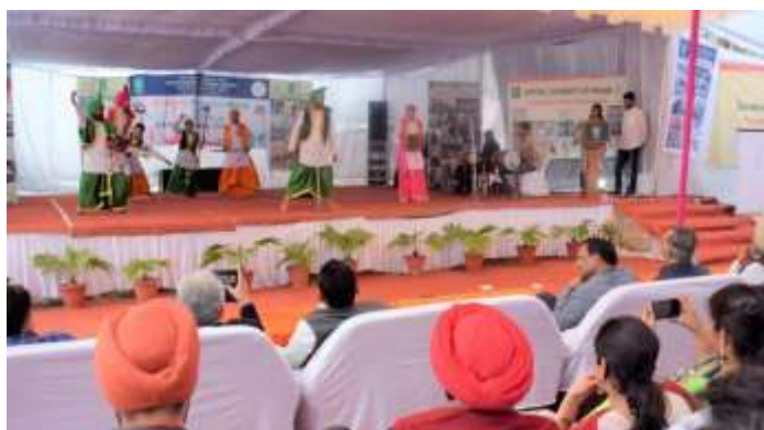
CUPB Students presenting Malwai Giddha