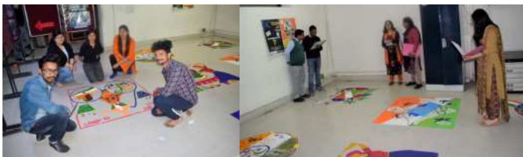
CUPB students preparing Rangoli Art Work (Left), and Judges inspecting Rangoli Designs prepared by students (Right)

Central University of Punjab organised Rangoli and Best of our Waste Competitions along with special cultural exchange programme on 23 rd and 24 th February 2020. These activities were held under Ek Bharat Shreshtha Bharat and the part of University's 11th Foundation Day Celebrations. More than 250 students from different departments participated in these activities. \