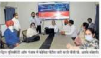
विद्युत युनिवर्सिटी ऑफ पंजाब में कोविड-19 पोर्टल लॉन्चिंग के दौरान