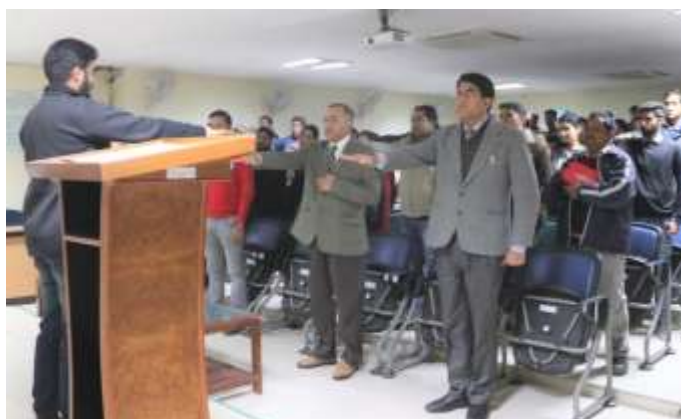
CUPB Faculty and Students taking Swachhta Pledge on the Inaugural Day of Swachhta Pakhwada 2020

On the first day of Swachhta Pakhwada, Swachhta Pledge was taken by Honourable Vice-Chancellor, CUPB Faculty, Staff members, administrative staff, students and NSS Volunteers at Seminar Hall. On the second day, CUPB NSS Cell