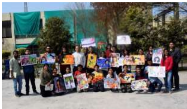
Group Picture of Participants of Poster Making - Beyond the brush Competitions

Central University of Punjab organised Poster Making, Face Painting & Pot Painting Competitions on 22 nd February 2020. These competitions were conducted under Ek Bharat Shreshtha Bharat, and this the programme was the part of University's 11th Foundation Day Celebrations These celebrations commenced with linguistic-cultural programme on Matrabhasha Divas on 21st February, and will continue till the University's 11th Foundation Day on 28th February 2020. More than 65 students from different departments participated in these games and exhibited their artistic skills & creativity by preparing impressive Posters Paintings, Face Arts, and Pot Arts.