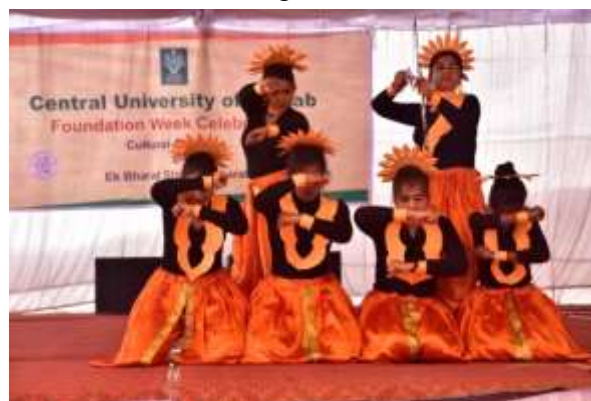
CUPB Students presenting the culture of their respective state through Folk Dance