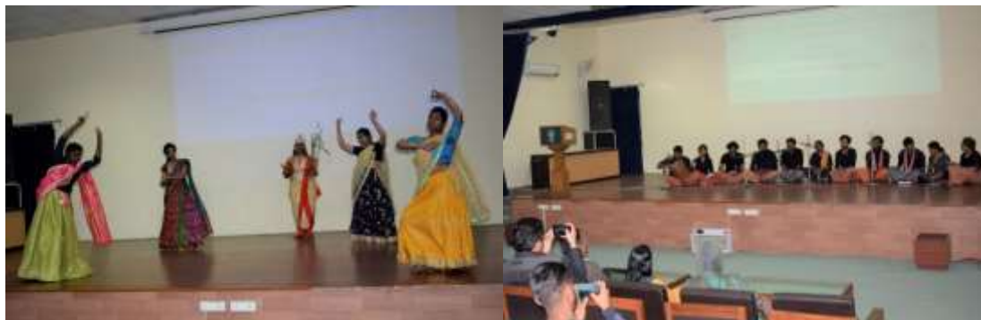
CUPB students performing Folk Dance on Telugu Song (Left) and Students singing Malyalam Song (Right)

Hindi and Dogri Languages respectively. Vidya & Group amazed everyone with their performance on Tamil Song – Tamil Thai Valthu.