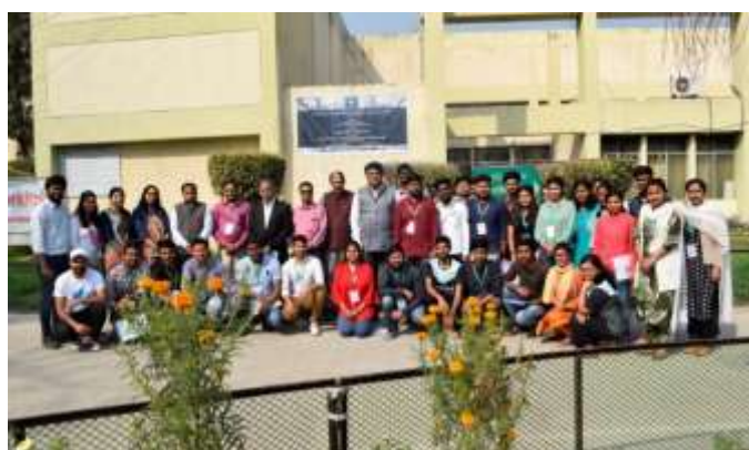
Group Photograph of Participants