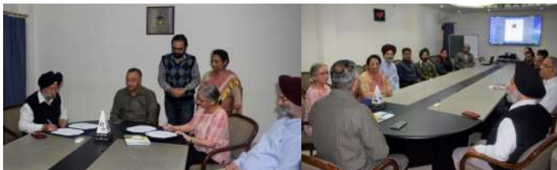
Glympse of MoU Signing Ceremony