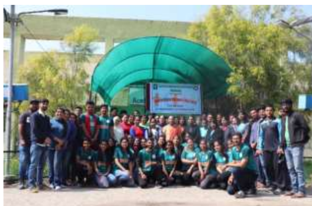
Group Photograph of Participants and Organising Team