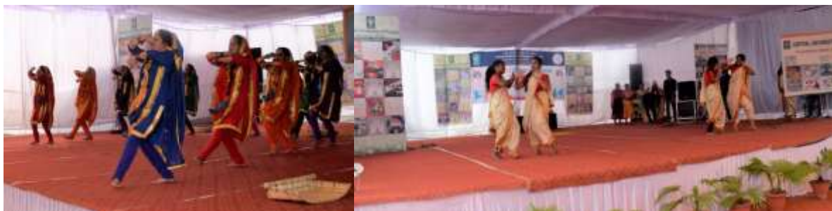
CUPB students performing Folk Dance of J&K (Left), and Folk Dance of Andhra Pradesh (Right)