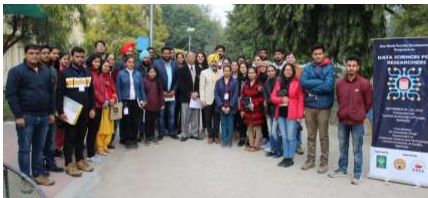
Group Photograph of the participants