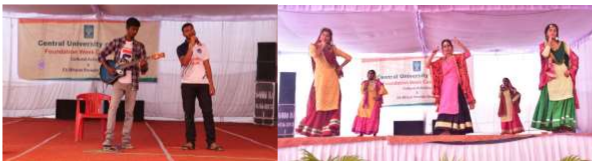
CUPB Students singing a Song (Left), CUPB students performing folk dance (Right)