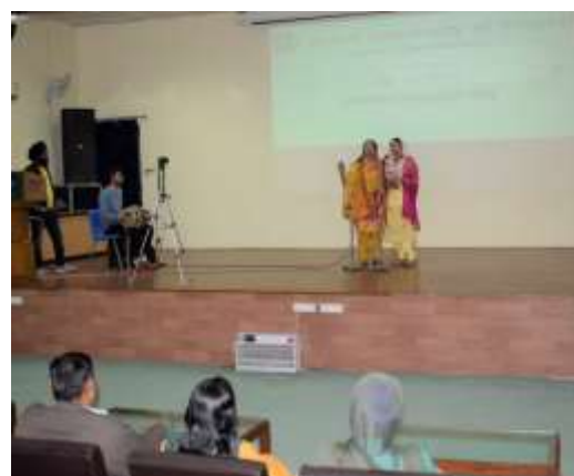
CUPB students performing Punjabi Folk Song