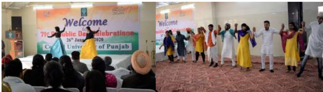
CUPB students performing a Cultural Dance (Left), and Patriotic Play Ek Bharat Shreshtha Bharat (Right),

To commemorate this day, a cultural programme was also organised in University, in which CUPB students showcased the beautiful performance of patriotic songs, poetry recitations and dance performances on the nationalistic theme.