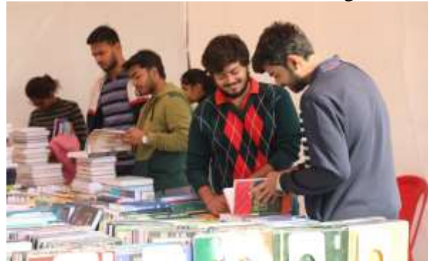
Figure 1 CUPB Students checking the books of their interest during the Book Exhibition