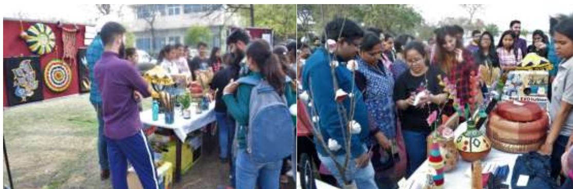
CUPB Students showcasing Best out of Waste Concepts

On Sunday, the Ek Bharat Shreshtha Bharat Club at CUPB organised a movie screening in Telugu Language and delivered a presentation to sensitise youngsters about the culture of Andhra Pradesh to more than 120 students. On Monday, Rangoli & Best out of waste competitions were organised. In Rangoli Contest, more than 16 teams participated and created magnificent Rangoli designs on Swachh Bharat Abhiyaan, Unity in diversity, and Patriotic themes. In Best out of waste competitions, 11 teams participated and exhibited their creativity with impressive home decor items, handbags, and accessories etc. CUPB faculty and students delightfully witnessed the creative rangoli artworks and availed the opportunity to purchase innovative products prepared from waste items. Participants impressed the judges & won the hearts of spectators with their creativity in these competitions.