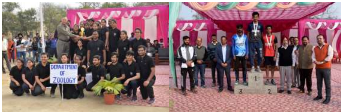
Glimpse of Award Ceremony