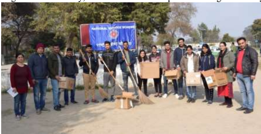
CUPB NSS Volunteers posing for a Group Picture during the Cleanliness Drive

On the first day of the programme on 16 th January, “Swachhta Pledge” was taken by Honourable Vice-Chancellor, CUPB Faculty, Staff members, administrative staff, students and NSS Volunteers. On 17 th January, CUPB NSS Cell executed “Shraamdhan/Plog Run Activity” in which NSS Volunteers collected Single-Use Plastic Waste from CUPB City Campus and later disposed of the same with the help of Municipal Corporation Waste Collection Team. On Voters Day, 25 th January, “Declamation Competition” was conducted to sensitize youngsters about the importance of Voter’s Rights. On this day, students also took part in “Slogan Writing Competition” and presented