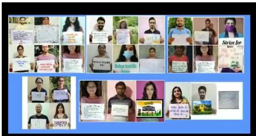
28 Students Volunteers of EBSB Club at CUPB from 28 States presenting our Fundamental Duties translated in their regional language.

government to combat the spread of COVID-19, and to appeal one and all to be a part of “Sankalp Se Sidhi Ki Aur” Movement.